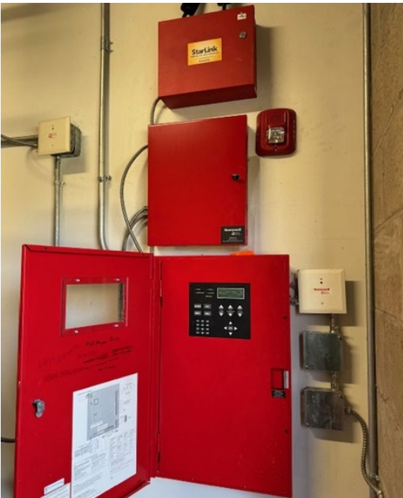
Interior Fire Panel