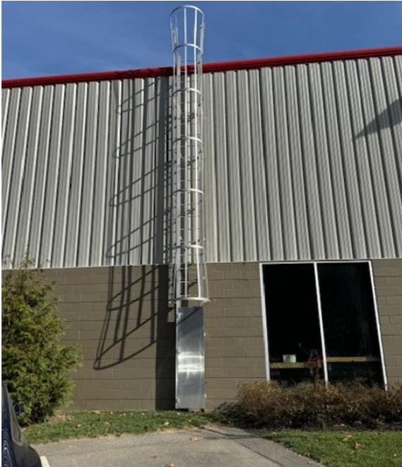
Exterior Roof Access Ladder