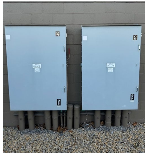
Exterior Electric Panel