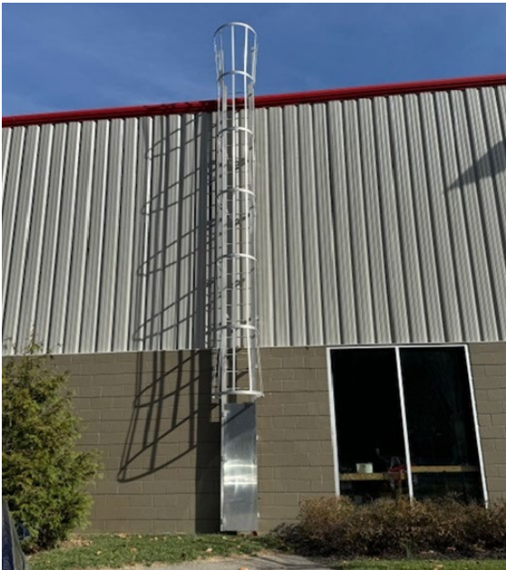
Exterior Roof Access Ladder