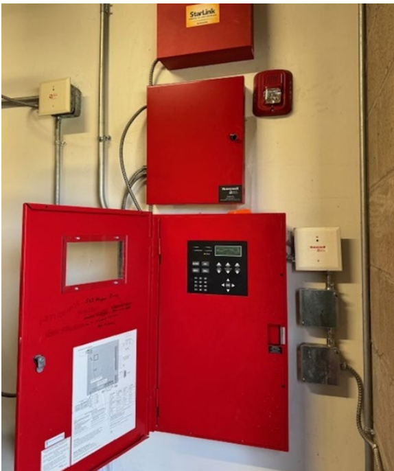
Interior Fire Panel