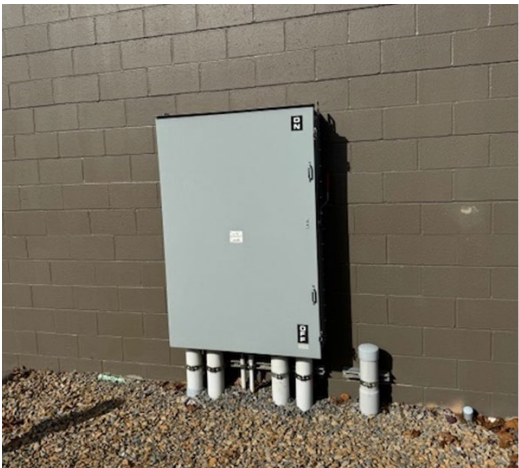
Exterior Electric Panel