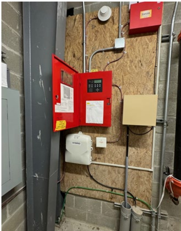
Interior Fire Panel